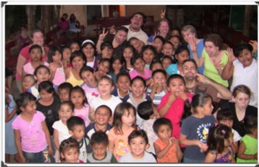
Chi Alpha team with our new friends.