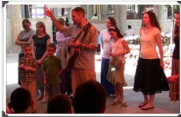
Leading songs for the children's service in Muna

This year we rolled up our sleeves and helped to pour a sidewalk in Opichen. We put the finishing touches on an expansion of the sanctuary in Muna (dug the foundation for it last year) and spent 2 days clearing a field for a new church plant. The rocks are big in Muna!